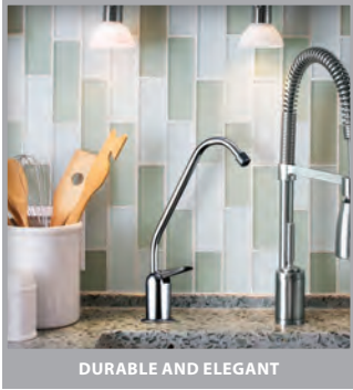
DURABLE AND ELEGANT