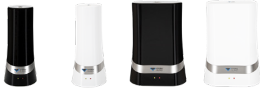
C1000 Black Finish